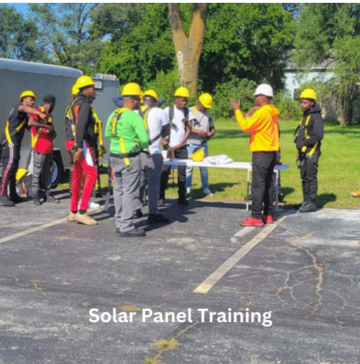
Solar Panel Training