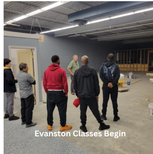
Evanston Classes Begin